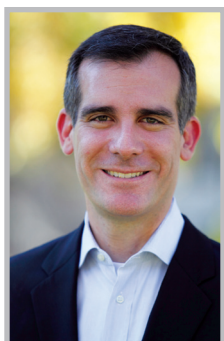
Eric Garcetti COUNCIL MEMBER

9030 WEST OLYMPIC BOULEVARD, BEVERLY HILLS, CA 90211